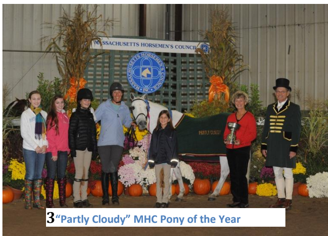
3 "Partly Cloudy" MHC Pony of the Year

All exhibitors were entered into a free drawing each day, one each of the older and younger Adults received a free stall and one Junior each day received a $300 gift certificate from Dover Saddlery, also all who competed received a MHC emblem keepsake box. First to go in each class received a bracelet from Show Stable Artisans.