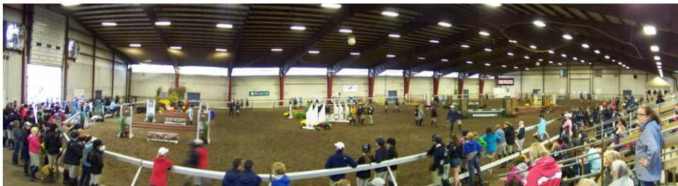
2